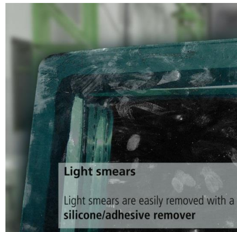
Photo 2. Light Smears

Please contact our Sales Team regarding any specific design criteria or quoting considerations you may have: