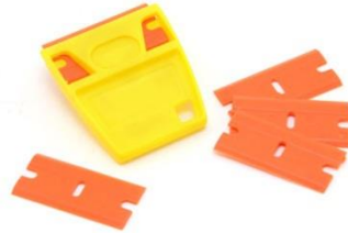
Photo 1. Plastic Razor-Blade